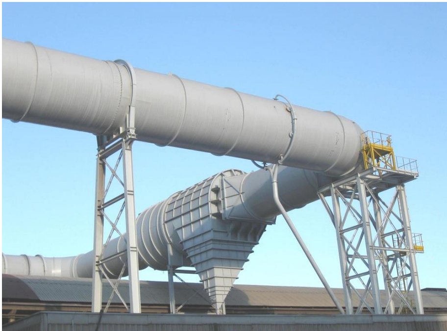
Fume suction and filtering system realized in 2010