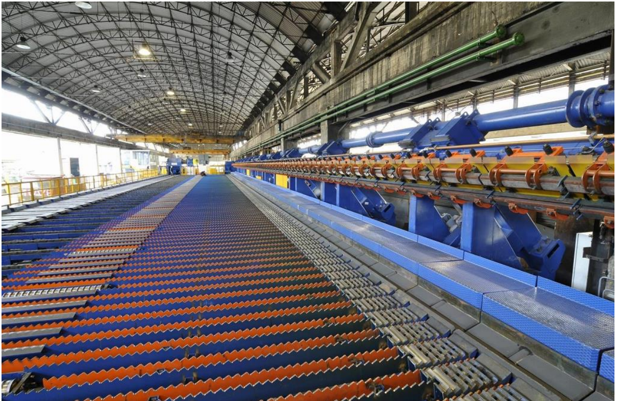
Sheet ingot casting