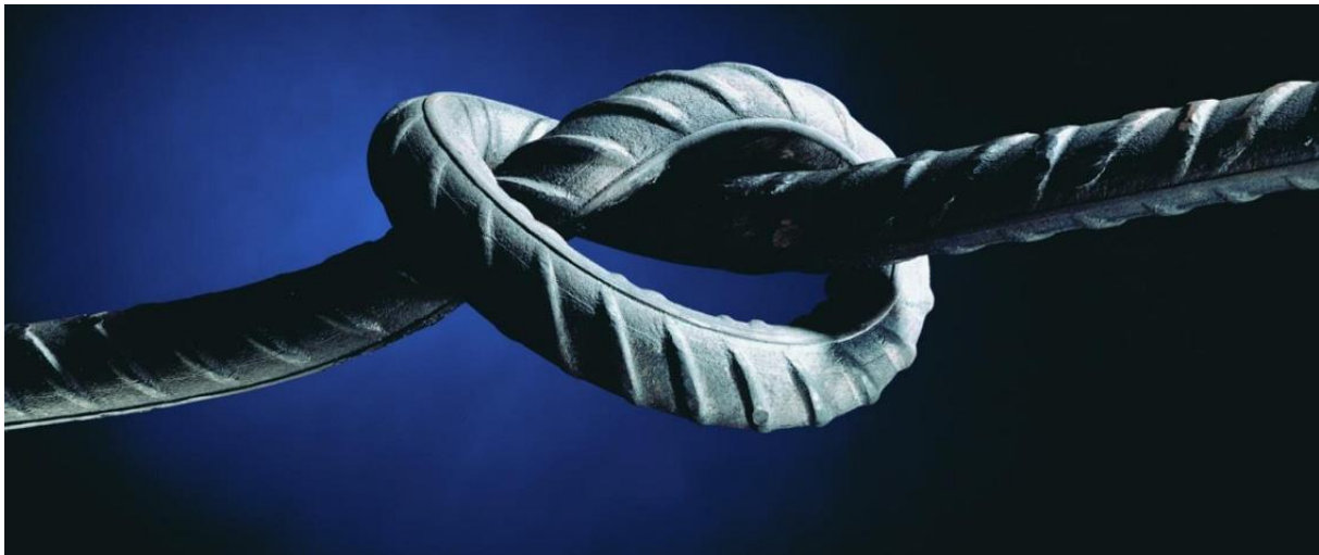
Knot with cold-drawn steel deformed bars for concrete reinforcement, diameter Ø 28 mm

Name and location of production site: Via Guglielmo Marconi, 13, 25076 Odolo (BS) - Italy