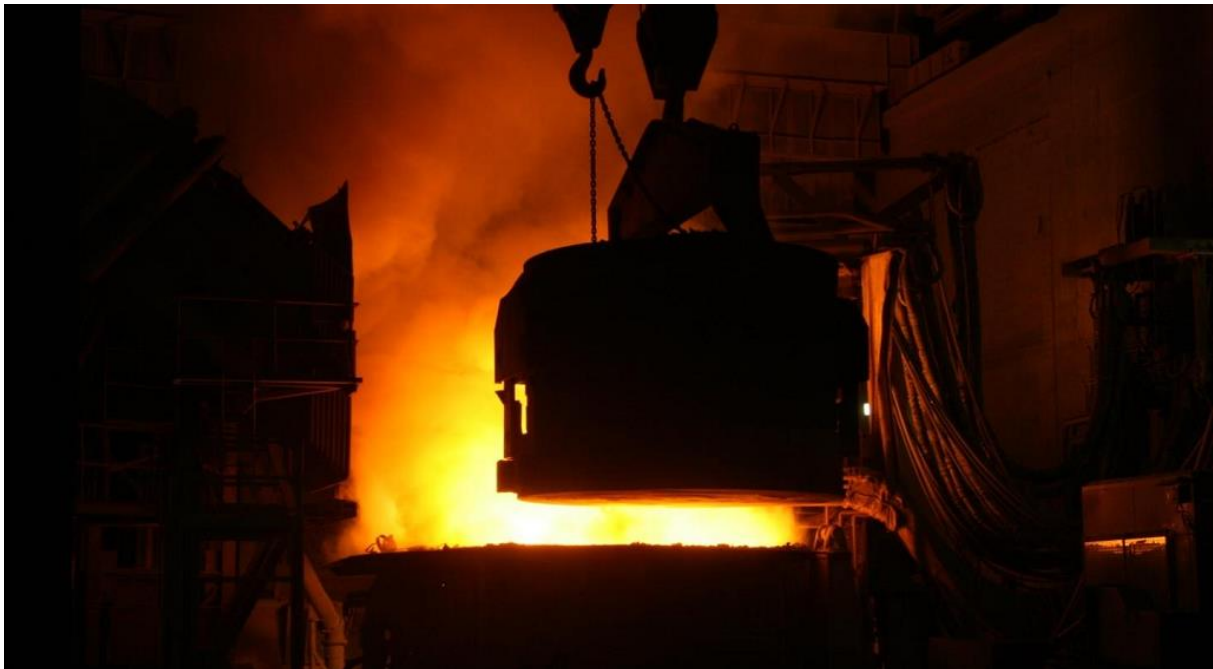
Steel scrap loading into the smelting furnace

This is exactly the purpose of our work. This is exactly why we have invested in ever new plants and in the most advanced technologies able to provide total control over each and every production parameter.